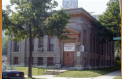
South Head Start